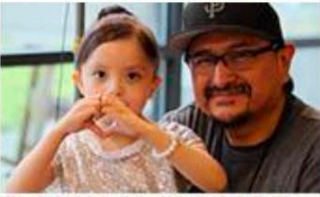
FAMILY HOUSE FAMILY STORIES