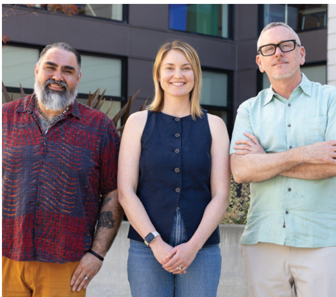
Our dedicated Family Services team